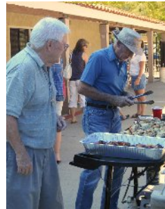
What's a picnic without chicken and hotdogs.