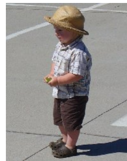
Water Balloon Toss