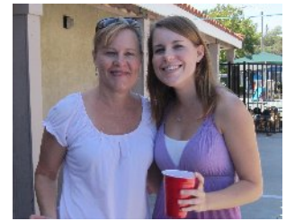
Mother & Daughter